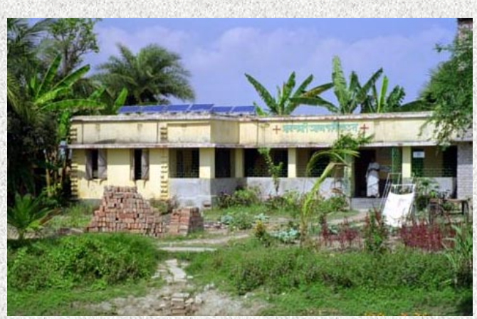
Health clinic in West Bengal, India