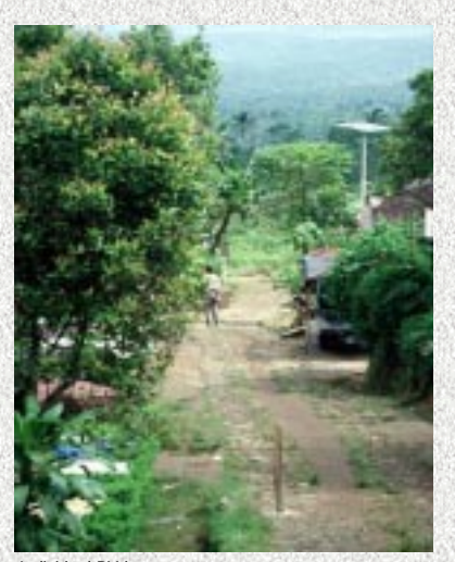
Individual PV home system