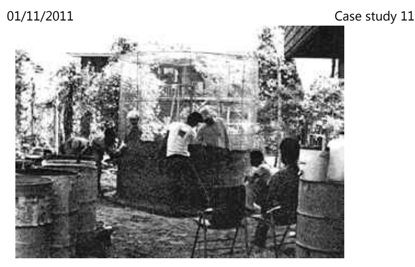
Figure 2 the tank skeleton being moved to site (Chayatit Vadhanavikkit)