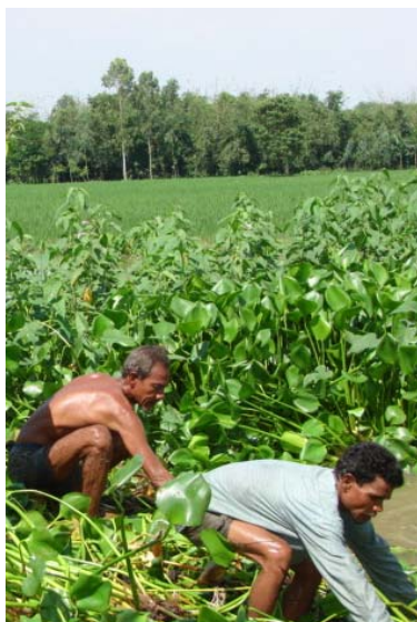
Figure 2: Collecting and stacking the water hyacinth.

Practical Action, The Schumacher Centre for Technology and Development, Bourton on Dunsmore, Rugby, Warwickshire, CV23 9QZ, UK