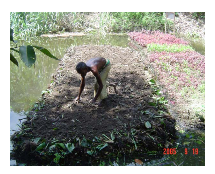
Figure 4: The floating garden with its earth layer.