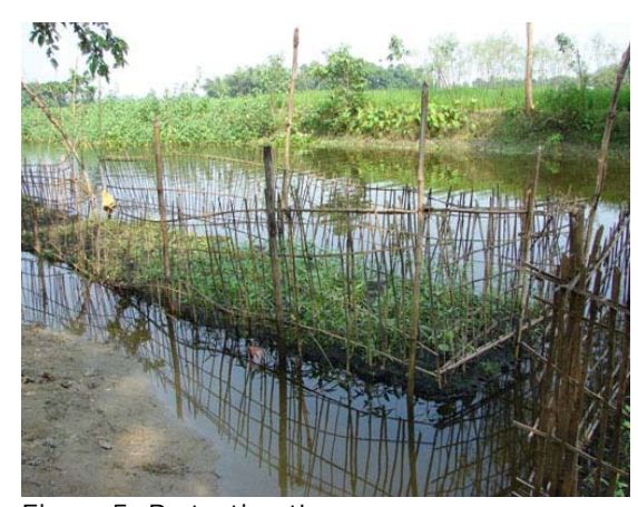
Figure 5: Protecting the crop from predators with a fence made from sticks.

Tara lives with her husband and son in a small compound in Shingria, 15km from Gaibandha town. She has been displaced by the river erosion seven times, and now lives on the government flood embankment. The family own 0.2 acres of land (approximately 800m²), but this is very sandy and infertile so Tara struggles to grow food during the dry season, and during the monsoons her land is covered by water.