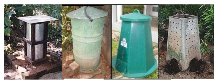
Plate: Different composting bin designs available in Sri Lanka.

Bin composting is the most popular and advance version of home composting system that overcomes problems experienced in other composting systems. There are different types of bins available for home composting and generally it varies from 200- 300L in size. These are from different materials such as cement/concrete, plastic, metal, etc. The bins allow higher stacking of composting materials and better use of floor space than free-standing piles. Bins can also eliminate weather problems and reduce problems of odours, and provide better temperature control. At present, most bins are designed to suit the urban landscape as well.