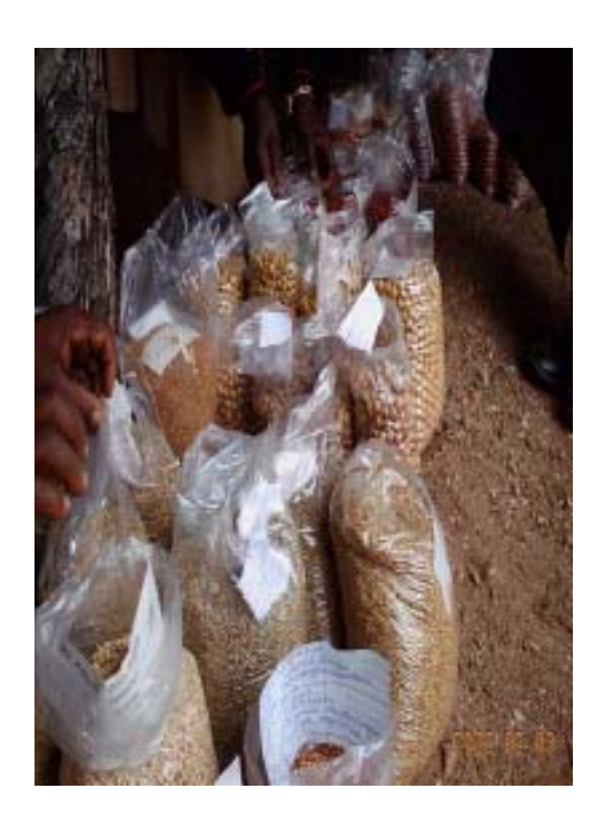
Figure 1: Village exhibitions at a Seed Fair in Gwanda District, Zimbabwe. The seed can be displayed in transparent plastic bags for easy viewing.