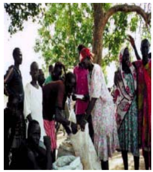
Figure 2: Seed traders display their seed and farmers purchase using redeemable vouchers.

Different crop types and seed varieties can be purchased at the fair and individual vendors who may include farmers, small-scale traders, large seed companies may offer either local traditional varieties or modern certified varieties. Instead of providing seed for recovery purposes, farmers are able to choose the variety and quality of seed they want.