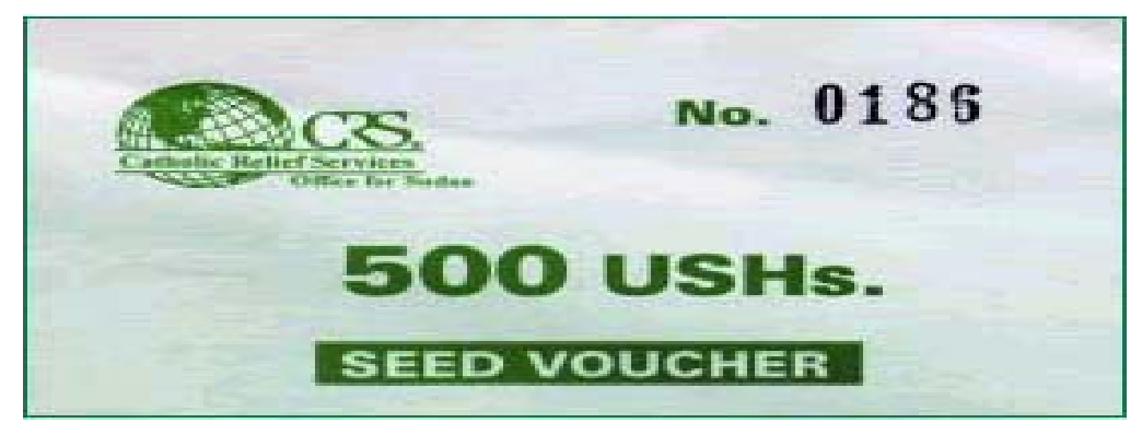
Figure 3: A seed voucher valued 500 Ugandan Shillings used by the Catholic Relief Services in Uganda.