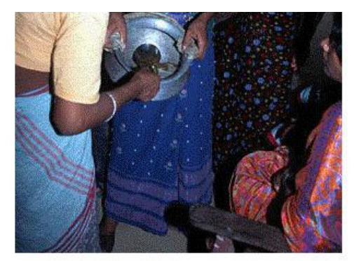
Figure 1: Testing whether the Jam has been boiled enough. ITDG food processing training course - making jam/jelly, Bangladesh.

One important feature of preserves is the high acidity which prevents the growth of food poisoning bacteria and also helps maintain the colour and flavour for most fruits. However, some moulds and yeasts are able to grow at the high acidity and these can spoil the food. They are prevented by ensuring that the