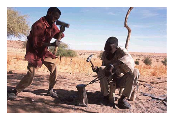
Figure 4: hammering one of the component parts of the plough

After initial trials in the project area (Kebkabiya), this technology was scaled up and disseminated to other areas in North Darfur including Azagarfa Village,