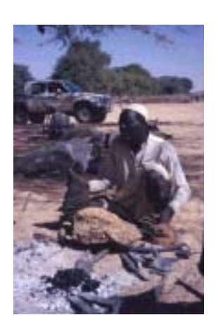
Figure 3: Metalworking in Darfur.

by many farmers in Ethiopia, the wooden ard plough. This is an assemblage of wooden pieces fitted together; it is lighter than many ploughs. The traditional design of plough for the region used a single handle that passed through a log. The log acted as the main body of the plough and only a small proportion on the plough was made of metal.