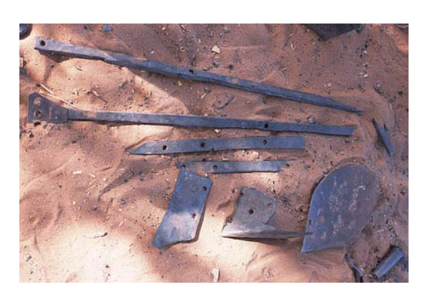
Figure 5: The plough before assembly

The Azagarfa Blacksmiths Society was registered in 1998 and Practical Action (then ITDG) organised the training of its members by other blacksmiths from Kassara who were already skilled in the improved design.