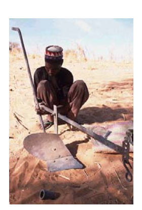
Figure 6: Assembly of the plough.

The donkey plough demonstrates the relationship between the different aspects of Practical Action's work from the adaptation of a traditional technology to the development of an intermediate technology and brings together farming, metalworking and the production of improved harnesses.