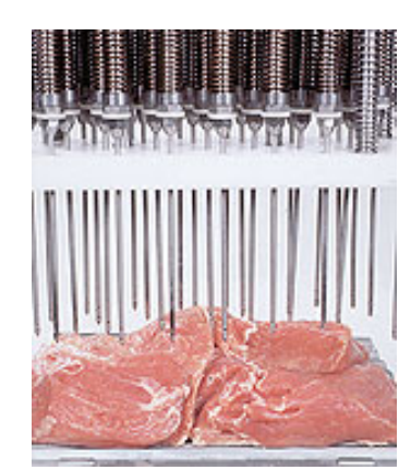
Figure 3: Brine injection needles.

After curing, the meat is allowed to dry and mature under refrigeration at below 5°C for approximately 5 - 7 days. The humidity in the room should be kept at approximately 85% by keeping the floor wet with saturated brine (not water) at all times (saturated brine gives an air humidity of 75%). Bacon is then sliced to the required thickness using a manual or electric meat slicer (Fig. 4.). It can be wrapped in greaseproof paper if it is sold quickly, or sealed in either plastic bags or plastic trays with heat-sealed plastic covers. It is stored under refrigeration for retail display for about 2 -3 weeks. Vacuum packing extends the shelf life further, but vacuum packing machines are expensive to buy and to maintain, and they are only suitable for processors that can justify the expense with high levels of profitability.