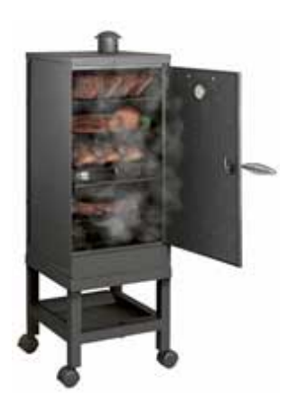
Figure 6: Meat Smoker.

More sophisticated smokers have fans to control the amount of smoke from the generator and to evenly distribute smoke in the smoking chamber.