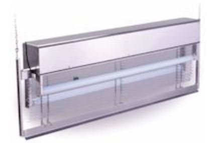
Figure 1: Insect electrocutor.

Opening windows should be screened with mosquito mesh. Thin metal chains or strips of plastic can be hung from door lintels to deter flying insects, or alternatively, mesh door screens can be fitted. A panelled ceiling should be fitted rather than exposed roof beams, which would allow dust to accumulate that might contaminate products. There should be no holes in the ceiling or roof, and no gaps where the roof joins the walls, which would allow birds and insects to enter. One or more insect 'electrocutors' (Fig. 1) should be hung from the ceiling in the processing room.