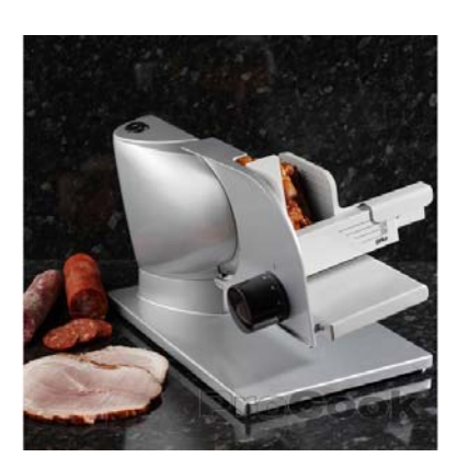
Figure 4: Bacon Slicer.

Cured hams are cooked by either roasting, or by boiling in sealed plastic pouches. The internal temperature should reach at least 70°C, with the cooking time approximately one hour for each kg in weight of ham. They are then sliced and packaged in a similar way to bacon. NB: because cooked ham is eaten without further cooking, it is essential that strict hygiene is enforced to prevent contamination of the meat after cooking. This is therefore a product that should only be produced by experienced meat processors.