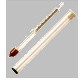
Figure 5: Salometer used to test brine strength

The main QA checks are to accurately weigh meat and curing salts to ensure that the correct concentrations are used in the brine. A 'salinometer' is a type of hydrometer that is calibrated to measure the concentration of salt in brine (Fig. 5). A sample of brine is placed in the testing cylinder, usually at 20°C, and the glass salinometer is allowed to float in the brine. The reading is taken from the stem of the salinometer and converted to % salt using conversion tables supplied with the equipment. If no salinometer is available, the correct brine strength is one that will just float a fresh egg or a freshly peeled potato.