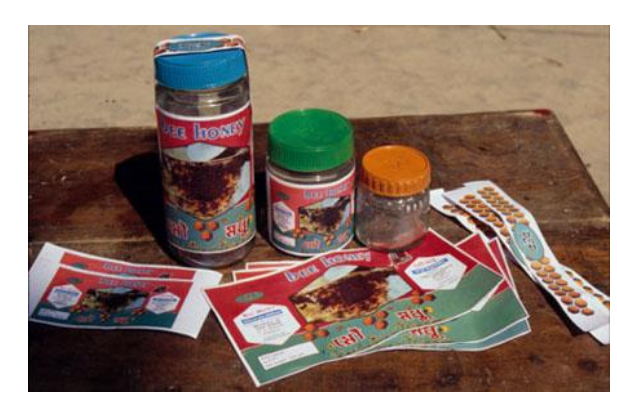
Figure 1: Honey pots and labels in Bangladesh.

Labelling is an important process in the food processing chain and should not be overlooked. The label is the first point of contact between a consumer and the producer. It is used to identify one product from another and also to make a decision over which product to purchase. The label is therefore the most important marketing tool for a product. It should be attractive and eye catching while at the same time being informative. A dirty, confused, untidy label will not help to sell a product.