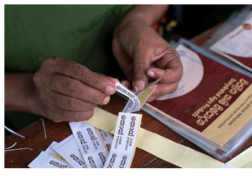
Figure 4: labelling dried jack fruit in Sri Lanka.