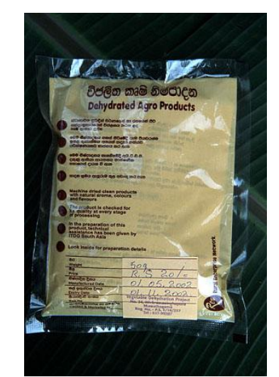
Figure 5: Details of when the fruit was produced and use by date are written on the back of the packaging.

The Codex Alimentarius (FAO/WHO) report on food labelling gives information on the legal requirements and food standards.