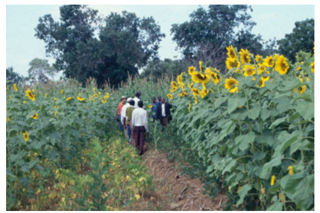
Figure 2: Sunflowers grown in Kenya

In many countries the oil processing sector is highly politicised and regulations exist which make entering the market difficult and tend to support the monopoly of the large processors. Large refineries may, for example, insist that farmers sell all their seed under a contract. In other cases seed has to be sold to a central Government marketing board, the board also supplies seed for planting.