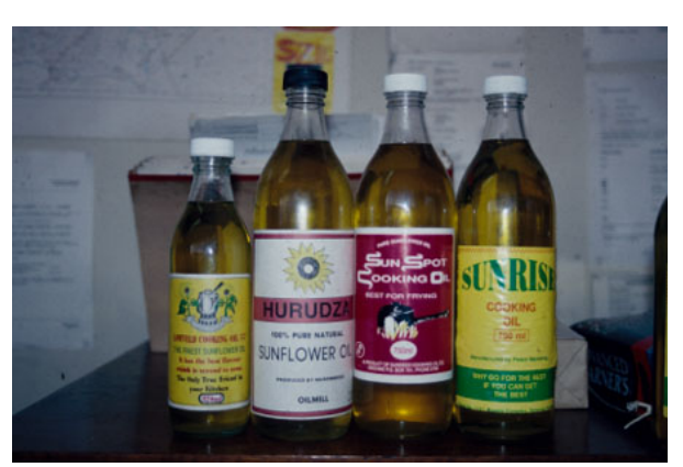
Figure 6: The final product in Zimbabwe

Degumming is a way of treating seed that have a high phosphotide content. The phosphotide, which makes a gummy residue, is removed by mixing the oil with 2 or 3 % water. This hydrated phosphotide can then be removed by settling, filtering or centrifuged.