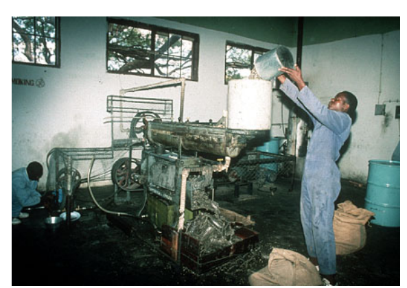
Figure 5: Tinytech oil expeller in operation in Zimbabwe.

In India in particular a number of efficient small or "baby" motorised expellers are available with a capacity of up to 100 kg/hr. A typical machine has a central cylinder or cage fitted with eight separate sections or "worms". This flexible system allows single or double-reverse use and spreads wear more evenly along the screw. When the screw becomes worn only individual sections require repair, thus reducing maintenance costs. As the seed passes through the expeller the oil is squeezed out, exits through the perforated cage and is collected in a trough under the machine. The solid residue, oil cake, exits from the end of the expeller shaft where it is bagged.