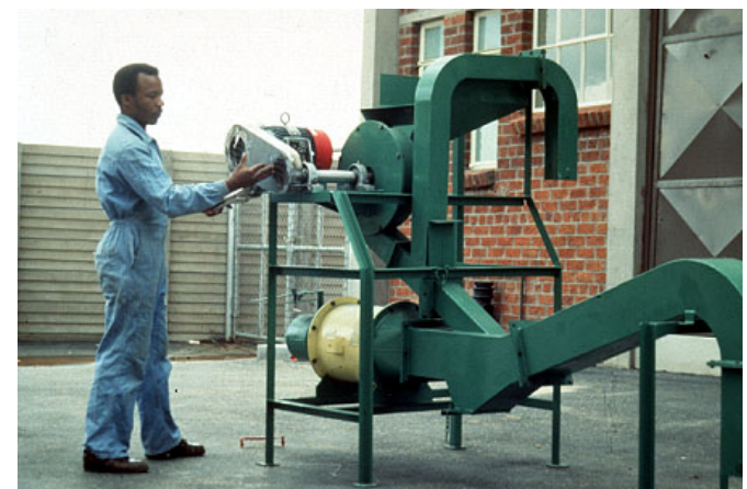
Figure 3: Decortication (removal/winnowing of husks) machine for sunflower seeds. The decortication machine is used in conjunction with Tinytech oil mills.

A wide range of manual and mechanical decorticators are available.