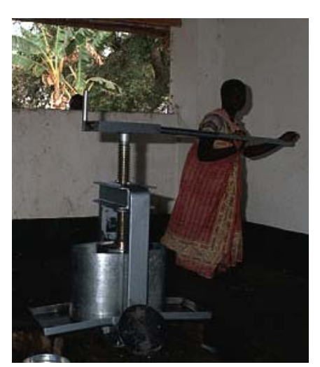
Figure 4: A manual screw press

The bridge press comprises of a cylinder that contains the seed which is compressed by rotating a screw down onto the seed. The screw is held in place by a frame that bridges over the seed container. As the seed is compressed the oil drains through holes in the cylinder onto a collection tray. The process is relatively slow as the cylinder needs to be filled, compressed and then the remaining cake needs to be removed.