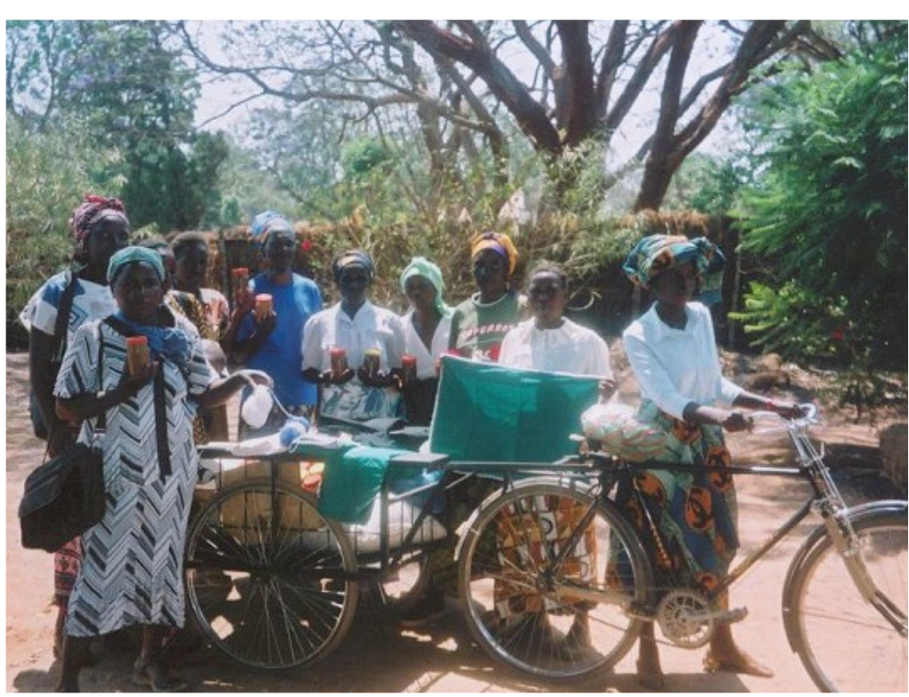
The Mthuzi Womens Group with their trailer.

Also an indirect benefit is the women, working together, share information such as on AIDS, child health and nutrition. Their success, such as in the peanut butter business, has created a culture receptive to new ideas and of willingness to learn. They have a literacy Group, pre-school group and so on.