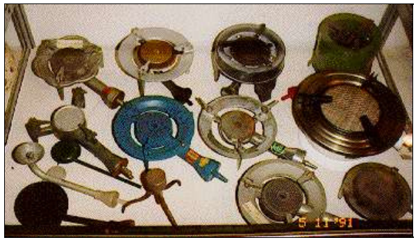
Different types of Biogas burners at an agricultural exhibition in Beijing/China

The aim of all such measures is to obtain a stable, compact, slightly bluish flame.