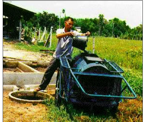
Drying of digested sludge and sludge disposal in Thailand

Anaerobic digestion draws carbon, hydrogen and oxygen from the substrate. The essential plant nutrients (N,P,K) remain largely in the slurry. The composition of fertilizing agents in digested slurry depends on the