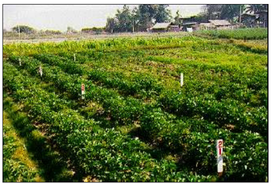
Field experiments with sludge in Thailand