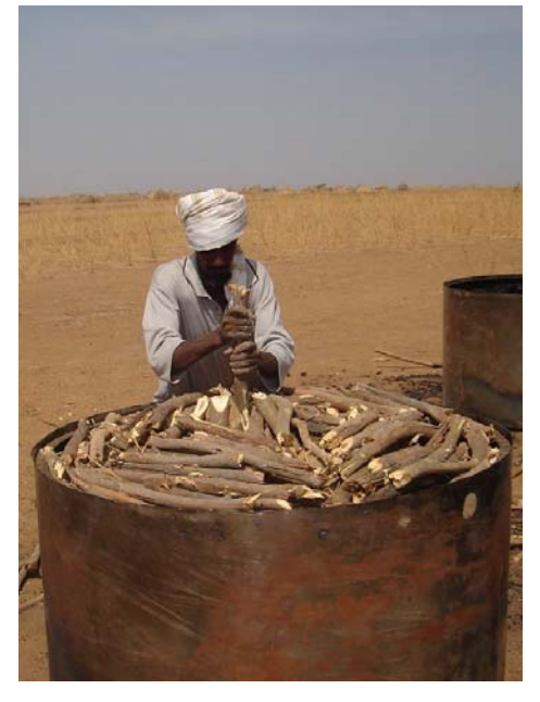
Figure 1: Charcoal production.

T +44 (0)1926 634400 | F +44 (0)1926 634401 | E infoserv@practicalaction.org.uk | W www.practicalaction.org