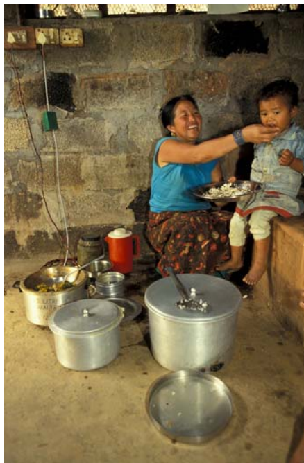
Figure 4: Low-wattage electrical cookers provide a clean environment and improve the load factor of micro-hydro schemes in Nepal.

Successful implementation of renewable energy schemes in rural areas is dependent upon a complex mixture of technological innovation combined with economical and institutional developments.