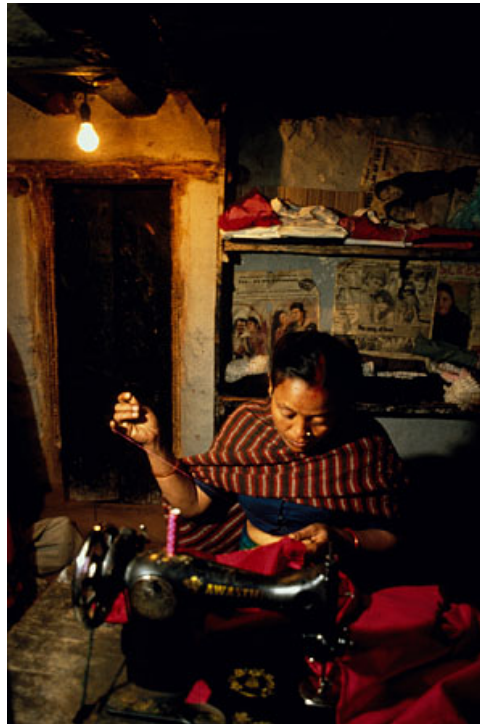
Figure 1: Domestic lighting. Micro-hydro project which supplies electricity to the community at Galyang Nepal.

Where lighting is the only significant use of electricity, monthly consumption tends to be in the range of 10 to 20 kWh. Two 40-watt incandescent bulbs used for five hours each night, for example, have a monthly consumption of 12 kWh. A radio-cassette player and a small fan can be used for 10 hours each day for an additional consumption of 10 to 15 kWh per month. A small colour TV used for 6 hours a day will add a further 10 kWh a month. A family could accommodate all these uses easily within a consumption range of 50 to 60 kWh a month. A refrigerator uses about 50 kWh and a freezer around 100 kWh a month. Ideally, extra demand would occur during off-peak periods in the middle of the day. Efforts have been made to increase the use of electricity in commercial activities that will use energy during this time, while limiting demand at peak periods.