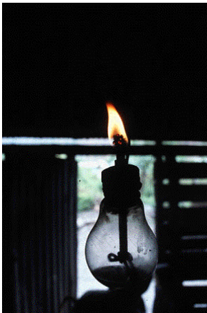
Figure 4: Example of wick lamp in Peru