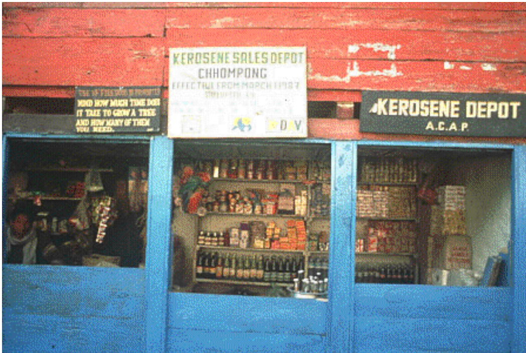
Figure 1: Kerosene is sold in rural centres throughout the world

Kerosene comes in liquid form. It is usually transported in bulk and in rural areas of developing countries is usually purchased by the litre or bottle. It is commonly found in rural centres and is used in most LDC's where it is sold by small retailing outlets or garages.