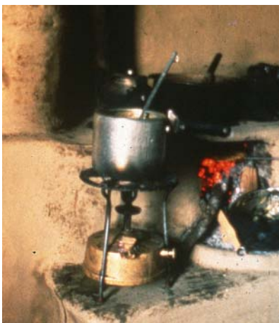
Figure 2: Kerosene pressure stove

The standard kerosene pressure stove comprises a fuel tank (which can be pressurised by means of a hand-operated plunger pump), a vapour burner and a pot holder (see Figure 3). Vaporised kerosene fuel is passed under pressure through a nozzle and mixes with primary air to form a strong blue flame. To initiate the process the vaporiser has to be preheated using an alcohol based flame which burns for several minutes in a tray placed below the vaporiser. Once the temperature of the vaporiser is raised sufficiently the kerosene can then be vaporised by the heat of the cooking flame and the alcohol flame can be allowed to extinguish. The pressure forces kerosene through the vaporiser continuously and is controlled by the adjustment valve or by regulating the pressure of the tank, which in turn controls the flame intensity. Again there are various designs based on the same operating principle, some with more than one vaporiser fitted to provide multiple cooking rings. Another means of pressurising the kerosene is to use a header tank. This does away with the need for a pressurised tank but also makes the stove more cumbersome. Typical maximum power output is in the range of 3 -10 kW.