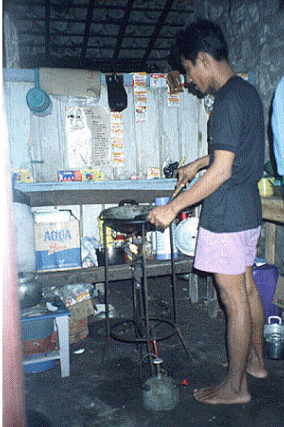
Figure 6: Use of LPG in Indonesia

Gas lamps use a similar rare earth incandescent mantle to the kerosene pressure lamp because the gas otherwise burns with a blue non-luminous flame. Again Camping Gaz is a common brand name and the lamps tend to be of simple construction with the mantle holder and valve assembly fitted directly to the bottle.