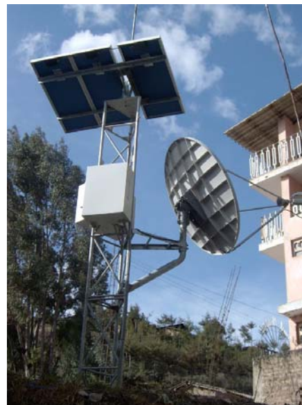
Figure 3: The La Encanada infocentre, Peru. It has solar panels to generate electricity and a satellite for connectivity.