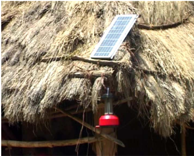
Figure 1: A photovoltaic panel being used in rural Nepal for solar lighting.

Photovoltaic (PV) is a technology that converts sunlight directly into electricity. It was first observed in 1839 by the French scientist Becquerel who detected that when light was directed onto one side of a simple battery cell, the current generated could be increased. In the late 1950s, the space programme provided the impetus for the development of crystalline silicon solar cells; the first commercial production of PV modules for terrestrial applications began in 1953 with the introduction of automated PV production plants.