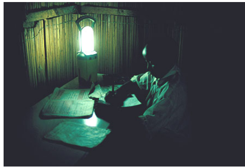
Figure 4: studying in Nakuru, Kenya.

A new innovation is the solar lantern. Originally designed for the outdoor leisure market in western countries, this simple lantern with a small PV module (5 - 10 watts) is extremely appropriate to use in rural areas of developing countries for replacing kerosene lamps.