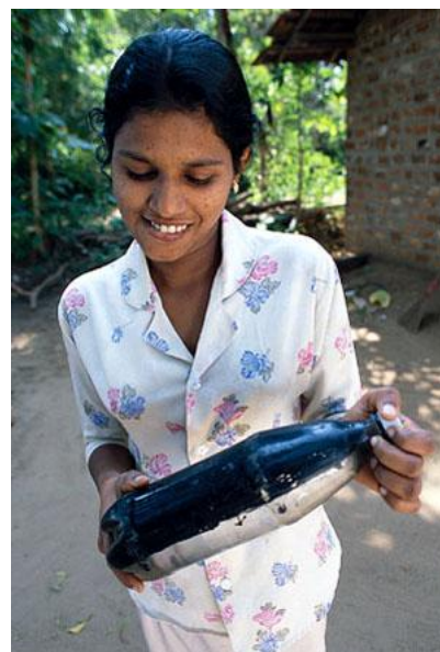
Figure 3: The back face of the bottle can be painted black to help absorb solar energy thus heating the water.