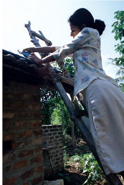
Figure 1: Placing plastic bottles on the roof to expose them to the sun, Sri Lanka.

Simple, hygiene practices in everyday life can have a huge impact on the public health condition in developing countries. It has been found that hand washing (with soap, ash or other cleaning agent) alone can reduce diarrhoeal disease transmission by one third. Hand washing, combined with safe disposal of human waste (faecal matter) and careful storage and handling of water can have great benefit towards reducing water-borne infections. Treating water to improve its quality should be combined with these health-promoting practices to make a lasting change in the public health of people in developing countries such as Sri Lanka.