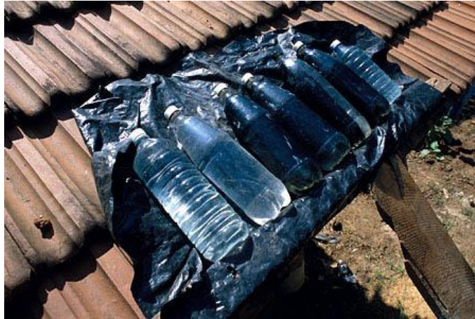
Figure 2: Bottles are left for the day.

SODIS is a simple, low-cost and easily replicable solution to clean drinking water. SODIS works through a combination of heat and pathogen-killing Ultra Violet radiation (both through sunlight). For this method to work well, the exposure to sunlight should be at least six hours, or until the water reaches a temperature of 55°C.