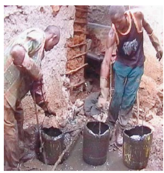
Figure 2: Manual emptiers operating in Kibera, Nairobi

In many urban areas of the world manual emptying methods dominate the sector. Manual emptying occurs most frequently where large vacuum tankers are unable to access sanitation facilities. It is also generally the cheapest way of removing enough waste to keep a pit operational, although it is usually the most expensive per unit volume.