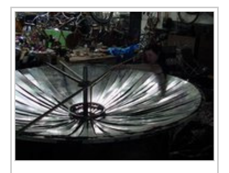
Getting measurements to calculate the focus.

with some Citra-Sol or something of that nature, but even without a shine job, the focus gets pretty hot. In terms of setting the dish up, all we need is to lean it up on something. There's a mount on the back of it with the capability of being staked in the ground.