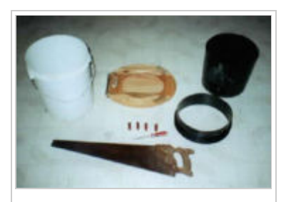
The tools and materials