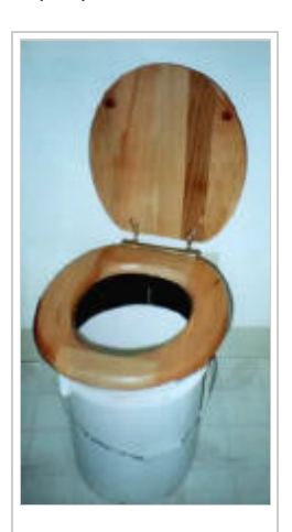
The sawdust toilet

and then becomes the sawdust bucket after filling with clean sawdust. The whole toilet system,