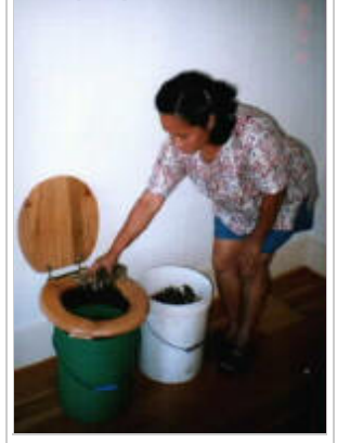
Covering with organic material