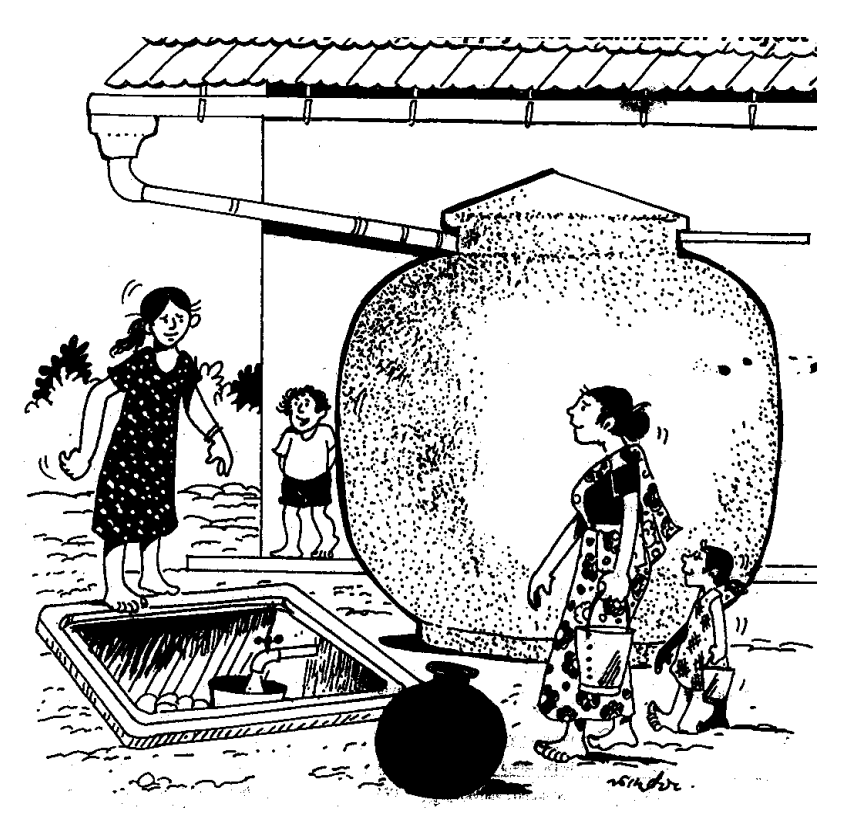
Figure 1: The Pumpkin water tank

The Abikon family of Demetaralhina in Badulla District chose a pumpkin tank. Their village is in a rural highlands area of the country and the ground conditions were not suitable for a groundwater supply or for digging a pit for a below ground tank. Average annual rainfall is 2250mm with a bimodal rainfall pattern (two wet seasons) and the longest dry period usually