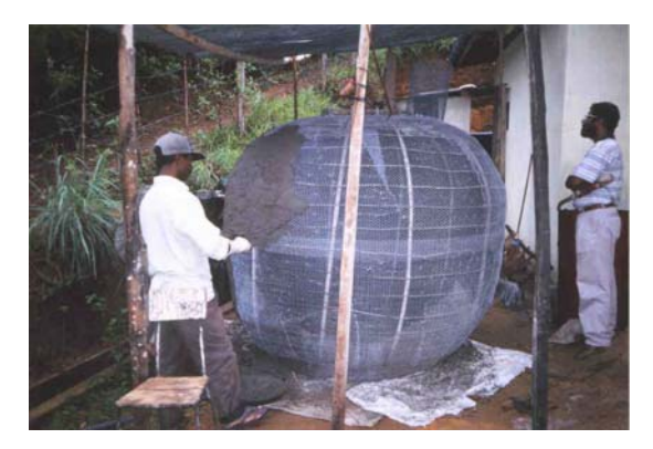
Figure 2: a) One of the 10 legs used to form the skeleton frame. b) The skeleton frame being rendered.