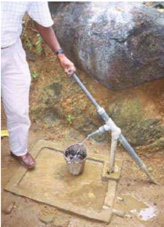
Figure 2: The Tamana pump installed at Batalahena Sri Lanka