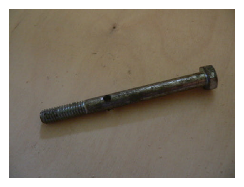
Drill a hole (9/64") through the 3.5" long bolt. The hole should be drilled on center at 2 3/8" from the bottom of the bolts head. The 9/64" hole is a good diameter to fit a 16D nail pretty tightly.