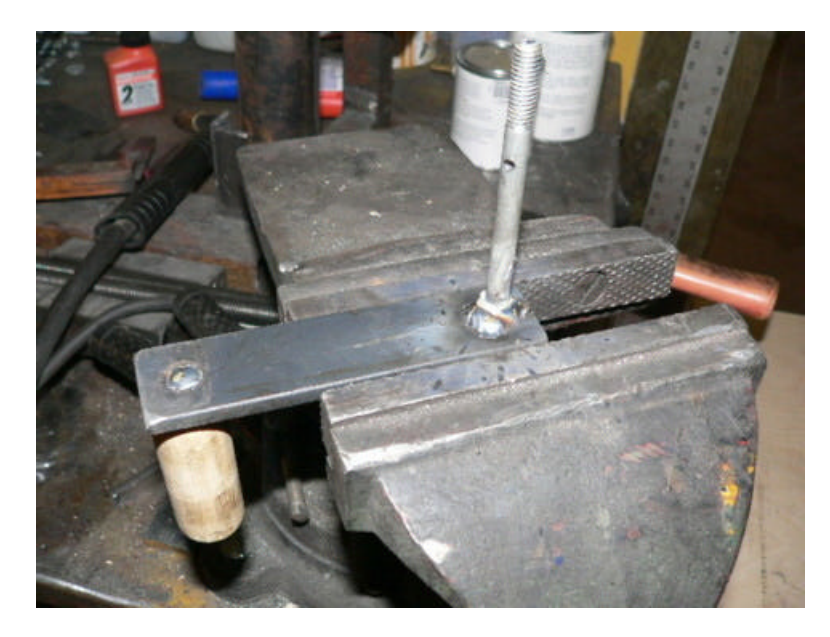
Take the longer bolt (the one with the hole drilled in it) and weld it to the other end of the handle as shown in the picture. It needs to be square !