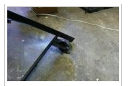
Table saw Cross cut saw

1" x 4" x 16' clear Doug fir 1" x 6"x 8' pine