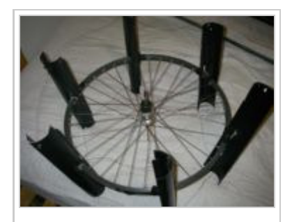
This was made in a hurry, but I plan to improve the design.