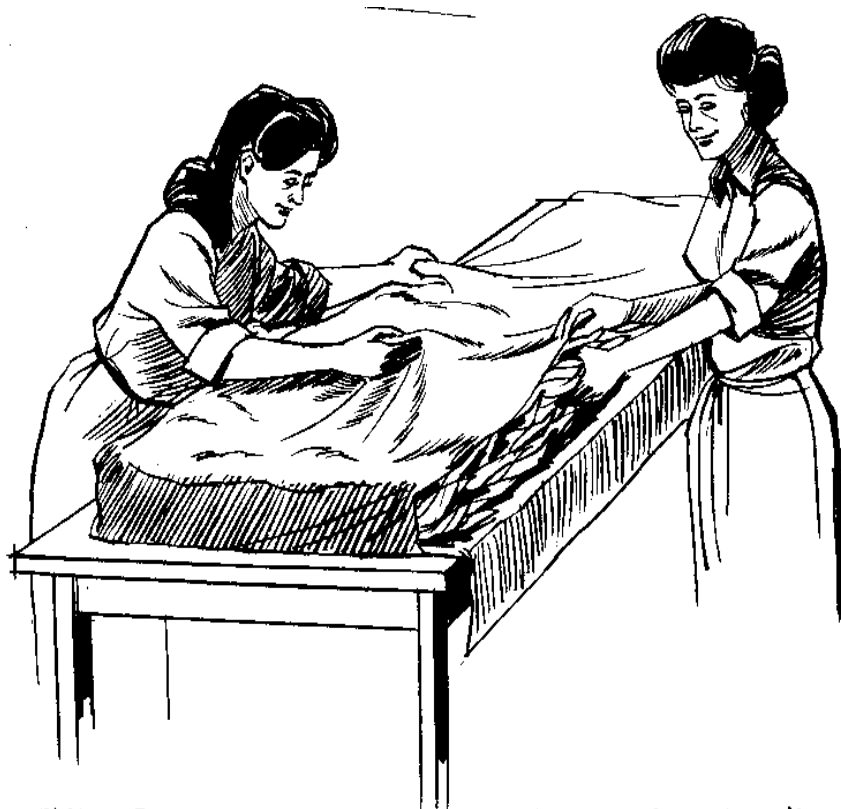
FIGURE 3. CORN SHUCKS OR SIMILAR FILLING MATERIALS ARE STUFFED INTO THE COVER, WHICH IS MADE FROM SIX PIECES OF CLOTH SEWN TO FORM A BOX WITH SQUARE CORNERS.

The first step is to dip the corn shucks in boiling water and, while they are still moist, shred them into small strips with a hand paddle that has small nails in it.