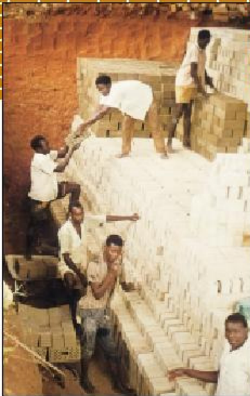
Fig. 4: Clamp dug into sloping ground

home.cd3wddvd.ar.cn.de.es.fr.id.it.ph.po.ru.sw