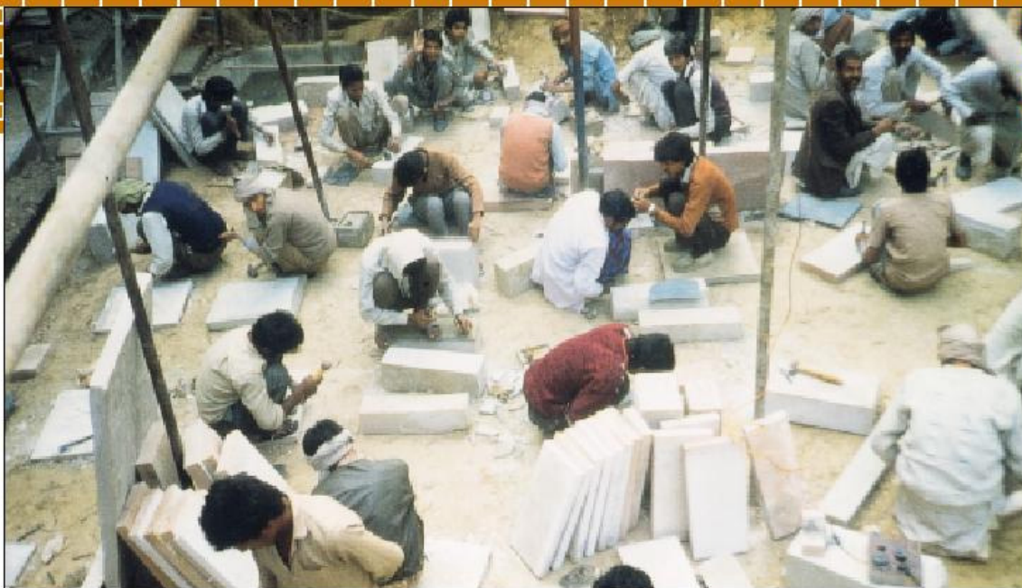
Fig. 5: Sandstone dressing in New-Delhi, India

home.cd3wd.ar.cn.de.en.es.fr.id.it.ph.po.ru.sw