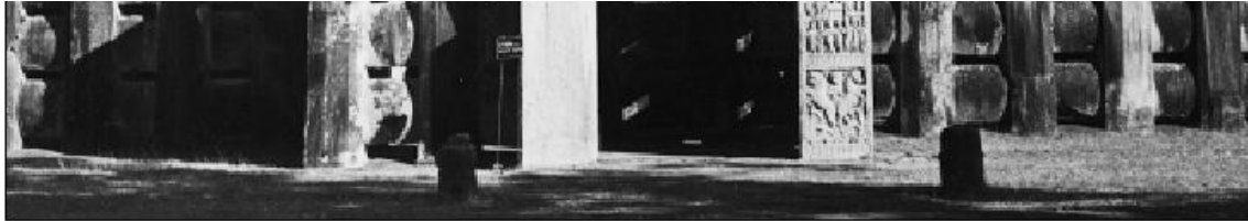
Fig. 3: Woodworkers techniques used at the Stupa in Sanchi, India, built about 2000 years ago

Fad: Stone is more difficult to work than wood - Fact: No.