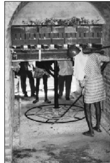
Fig. 4: Single-screw device VSBK-3.

performing units handled by inexperienced operators. However, it is a fact that the VSBK technology is finally taking roots outside China.