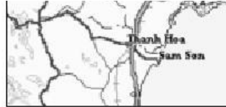
Fig. 6: Location of Bat Trang clamp kilns

capacity: 100,000 bricks construction cost: 10 million VND approx. 860 $) fuel use: coal 5, 2 tons + firewood 1 -1.5 tons energy consumption: 2.1 MJ/kg fired brick fuel cost per firing: coal- 5,000,000 VND briquette making - 560,000 VND firewood - 650,000 VND