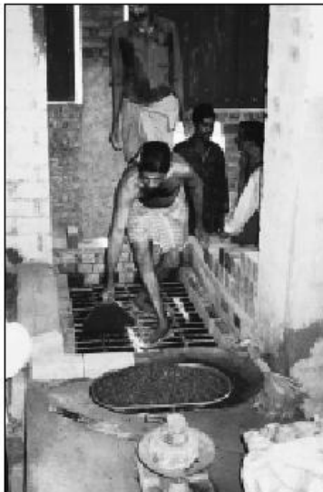
Fig. 3: VSBK-3 in Palgath.

A local organisation, MITCON-DAMLE has constructed a VSBK with shafts larger than anywhere else including China. DA is providing the expertise. Firing started in January 1999. The kiln is located with the green brick production area