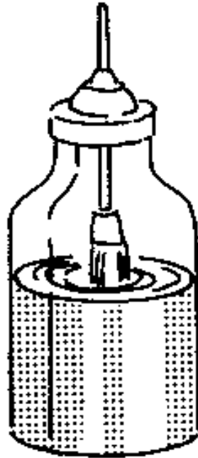
FIGURE 3. A DISPENSER CAN BE MADE BY CUTTING A HOLE IN THE COVER LARGE ENOUGH FOR THE HANDLE OF A 2.5 CM. BRUSH. THE DISPENSER MUST BE AIRTIGHT SO THAT THE CEMENT WILL NOT DRY OUT.

the hole and leave the brush in the jar. This should be airtight because the cement hardens quickly when exposed to air.