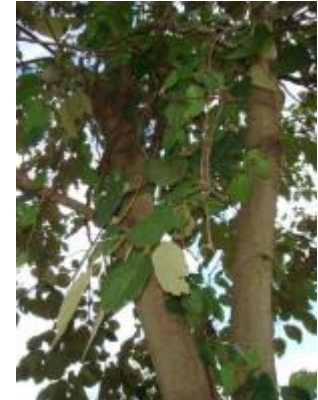
Mondia whitey climber in

Mondia whytei is a slow growing vine that used to be abundant in Kakamega Forest but is now getting scarce. Main threat to the species has been over