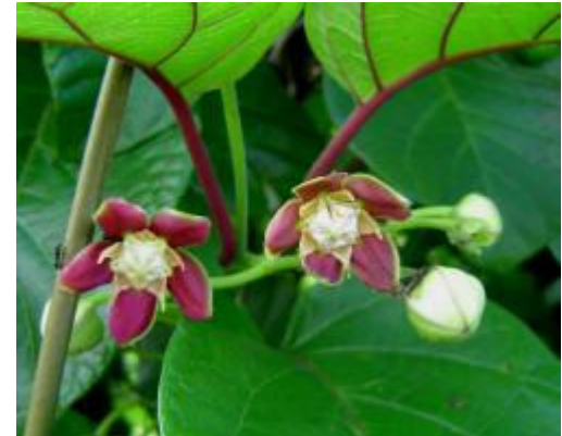
Mondia whitey flower.

The roots of Mondia whytei are harvested extensively from Kakamega Forest in a well organized trade leading to scarcity of the plant Mondia whytei roots are sold in towns in Kenya and in other African countries. The roots are eaten by the young and old as a flavoring and appetizing agent. More than 500 members of the community adjacent to Kakamega Forest were trained in methods of cultivating M. whytei on-farm. Community