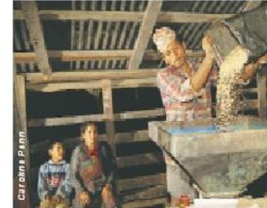
Using micro-hydro to power this grain mill in Nepal provides opportunities for generating additional income.

As in the Sri Lanka example, community involvement implies capacity building and training so that the community can continue to manage and maintain the resource, making it financially and institutionally sustainable.