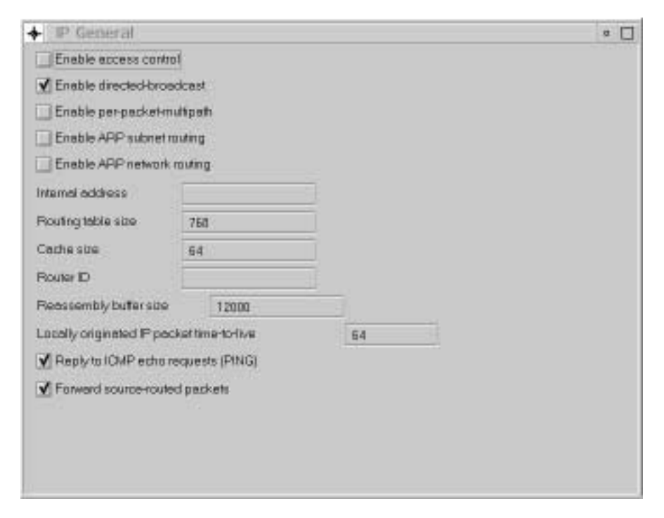
Figure 5. A Sample Configuration Window