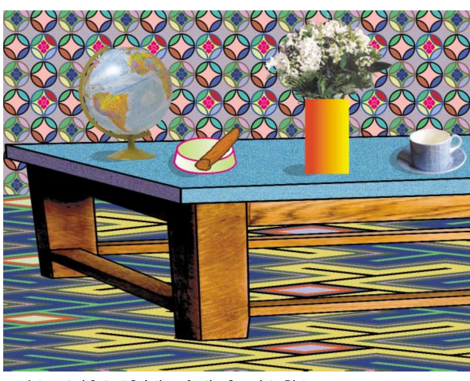
Integrated Output Solutions for the Complete Picture