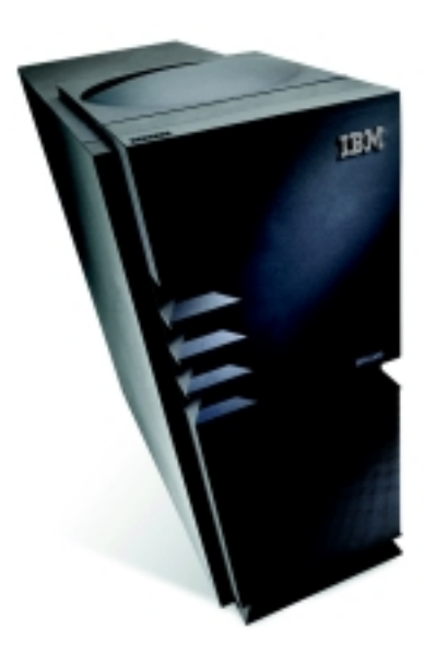
The Infoprint 2000 AFP System leverages the RS/6000 to optimize datastream processing, cache and reuse image objects, and to provide bi-directional job management and page-level error recovery.

To learn more about the Infoprint 2000 and its ability to help you become more e-business compliant, contact your local IBM sales representative or visit ibm.com /printers