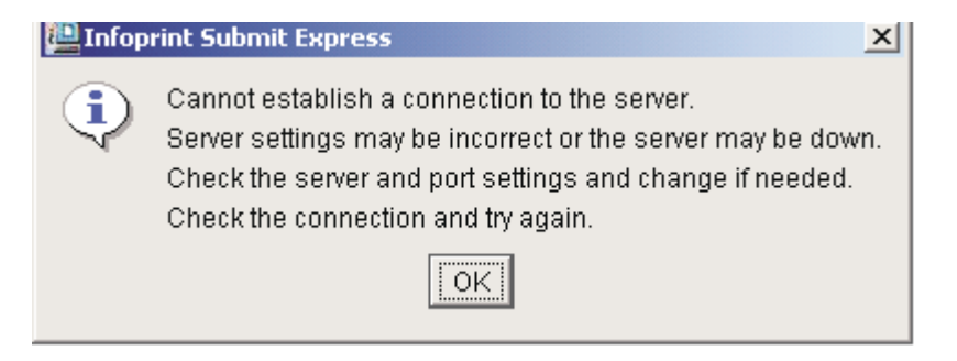
Figure 2. Message displayed first time Infoprint Submit Express starts