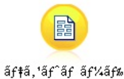
Figure 3. Node label containing non-ASCII characters, displayed incorrectly

However, the resulting node will have an incorrect label.