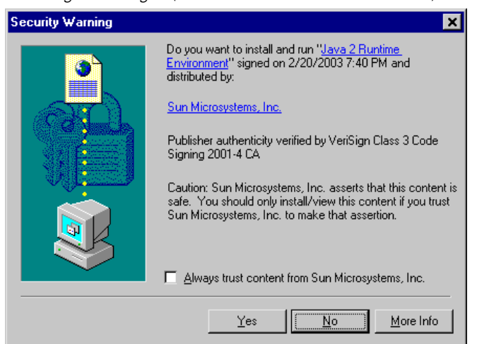
Figure 3-1 Installing Java Plug-in (with Java 2 Runtime Environment) from the server