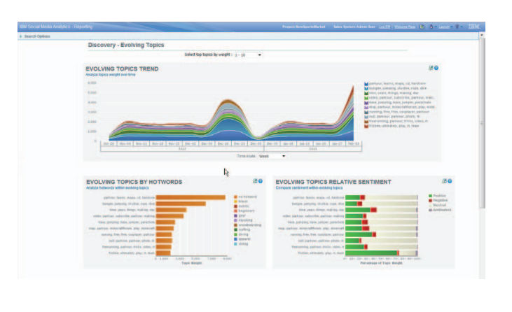
Figure \ 3: Evolving topics are expressed as collections of frequently used keywords.

For example, the top four keywords observed within a group of snippets that mention a particular sports shoe might be "football," "soccer," "World Cup," and "South Africa." These keywords suggest that the product was frequently discussed in the context of the 2010 World Cup soccer tournament in South Africa. Evolving topic analysis allows you to follow trends and common discussion topics across time periods and in reference to related keywords.