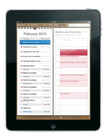
Figure 3: iPad tablet displaying the Lotus Notes Traveler calendar

If your enterprise wants to deliver a push email solution, IBM Lotus Notes® Traveler software provides IBM Lotus Notes email, calendars and contacts on your Android, iPhone and iPad, Microsoft Windows Mobile, or Symbian device. By bringing your latest messages, schedules and contacts to the