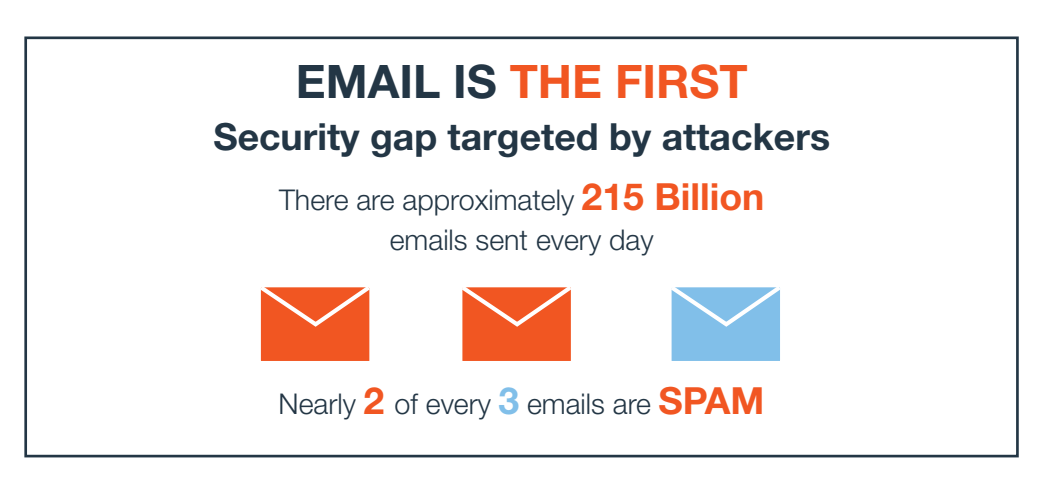
Figure 1: FireEye Infographic<sup>1</sup>

This paper starts with the highlights of recent cyber-attack threats and exploitation techniques, with a focus on one of the weakest channels of attack – e-mail. Then we share some of the best practice recommendations to help reduce malware infections from cyber-attacks and discuss some of the advanced security features in Email Security Products that can help protect organisations from email-borne attacks.