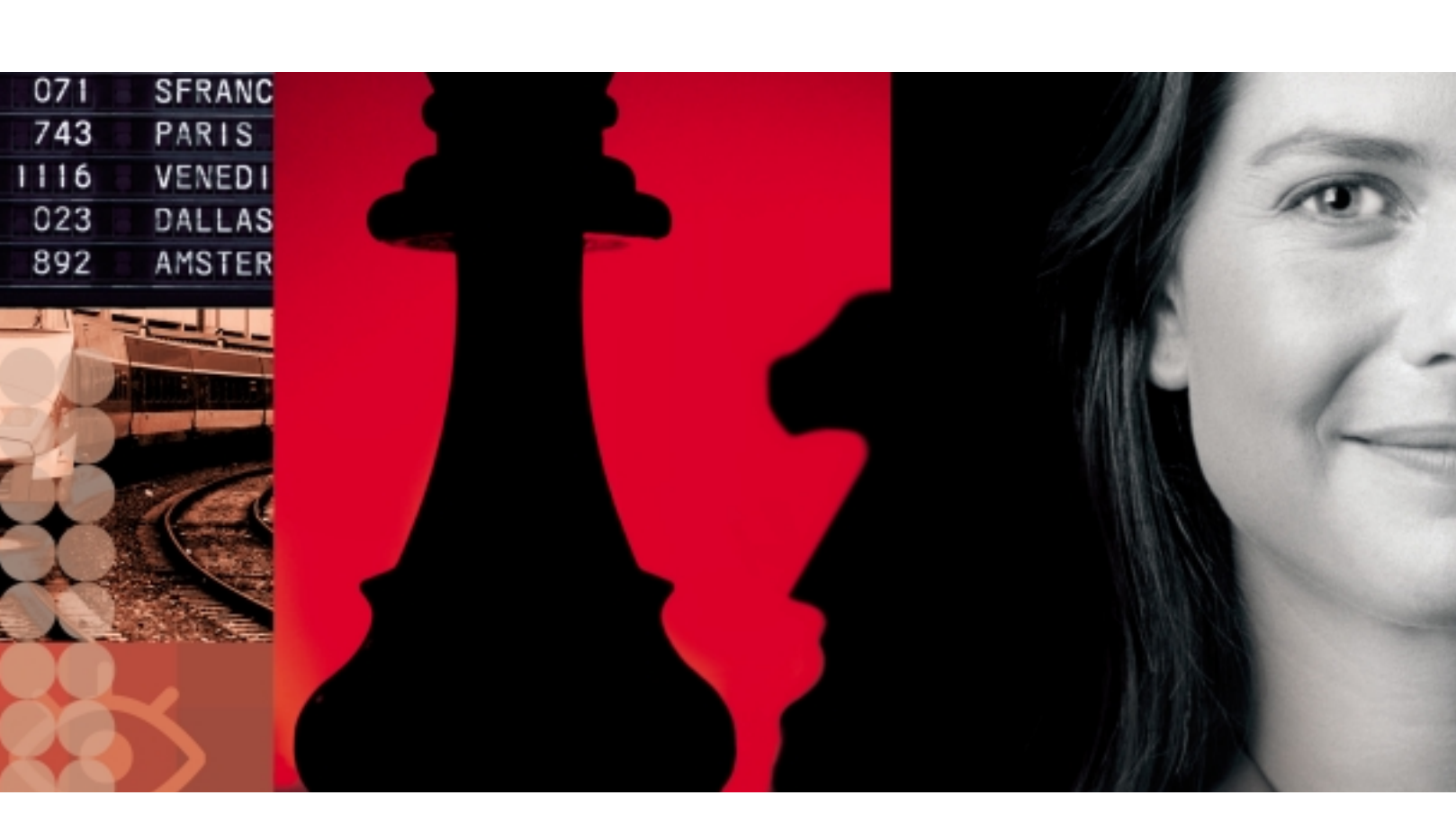
Tivoli software and the next chapter of your e-business strategy.