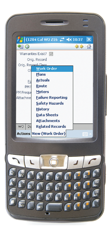
Maximo Mobile Work Manager with Calibration option