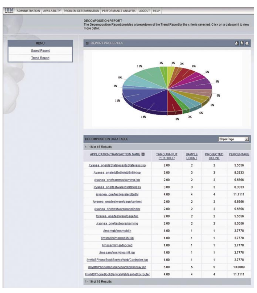
WebSphere Studio Application Monitor provides detailed reports for application performance management.

to the needs of the moment. For production monitoring, use a high-level "Enterprise View." When a bottleneck occurs, switch to a more detailed view to gather additional information to better diagnose the problem.