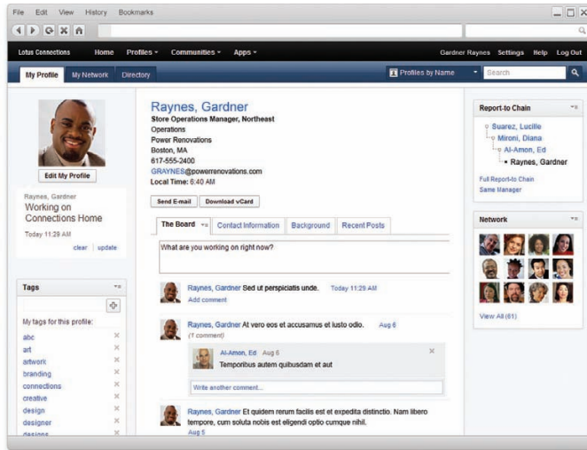
Figure 1: IBM collaboration solutions help people connect to experts and the richness of their work, not just their contact details.