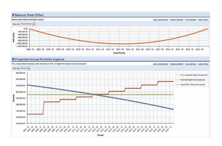
Figure 1: Financial analysis within IBM TRIRIGA identifies balance sheet and income statement impact of leases that result from new lease accounting rules

With IBM TRIRIGA, organizations get the alerts and information needed to identify high performing locations, avoid overpayment and comply with new financial reporting requirements.