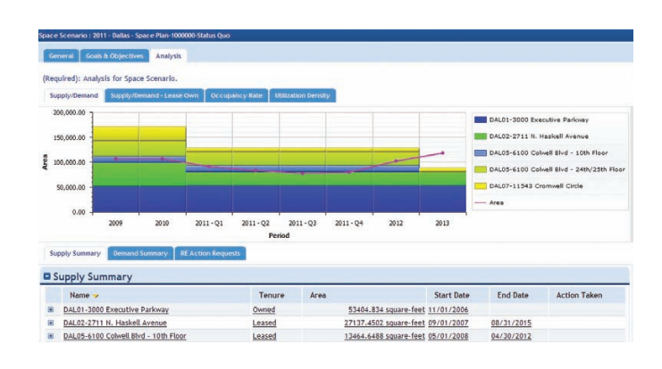
Figure 3: Facility demand-supply analysis within IBM TRIRIGA visually identifies costly gaps in the availability of space

Because they directly integrate with other financial and operational modules IBM TRIRIGA's advanced facility management features ensure your organization's buildings and staff operate at their best, even as the way the operate together continues to change.