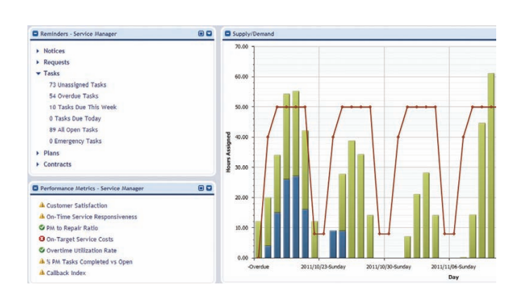
Figure 4: Alerts, metrics and reports within IBM TRIRIGA identify areas that require corrective action