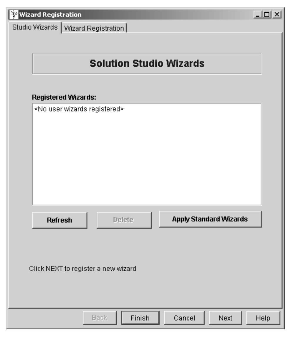
Figure 2. The Studio Wizards page of the Wizard Registration wizard

5. You can select other products to use with Solution Studio from the Wizard Registration page. With the Wizard Registration wizard open, click the Wizard Registration tab. The Wizard Registration page opens, as shown in Figure 3 on page 10.