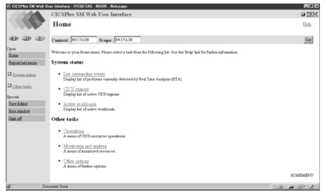
Figure 10. Example home menu

An example of a home menu is shown in Figure 10.