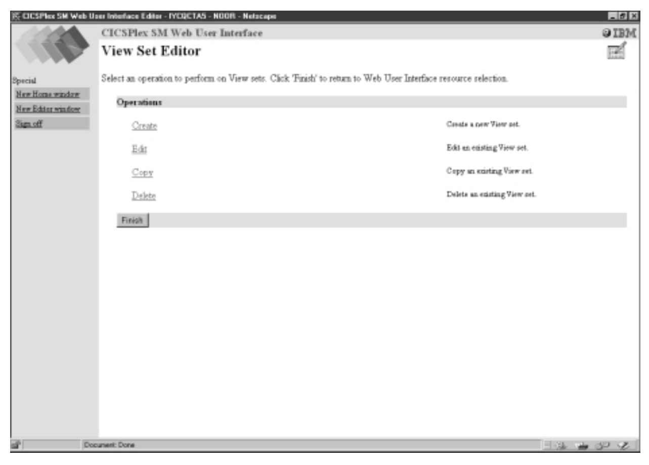
Figure 26. View Set Editor panel

If you elect to work with views you click the View sets option from the CICSPlex SM Web User Interface Editor panel. You are presented with the View Set Editor panel, as shown in Figure 26. You have the options of creating a new view set, editing an existing view set, copying an existing view set, or deleting a view set.