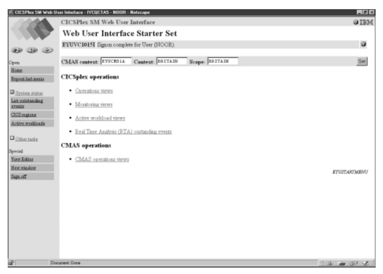
Figure 11. Starter set home menu

or menus until you change them. Changed context and scope settings apply only to the current view and all subsequent views. If you go back to a previous view or menu, the context and scope values are restored.