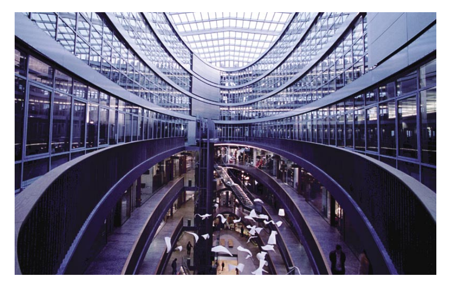
Headquartered in ultramodern premises in Düsseldorf, Germany, BBDO INTERACTIVE has won many prestigious awards for its bold creative vision.

Whether they are selling cars or candy bars, advertisements have become more than just marketing tools. They've been elevated to the realm of entertainment. And Web sites are one of the newest channels.