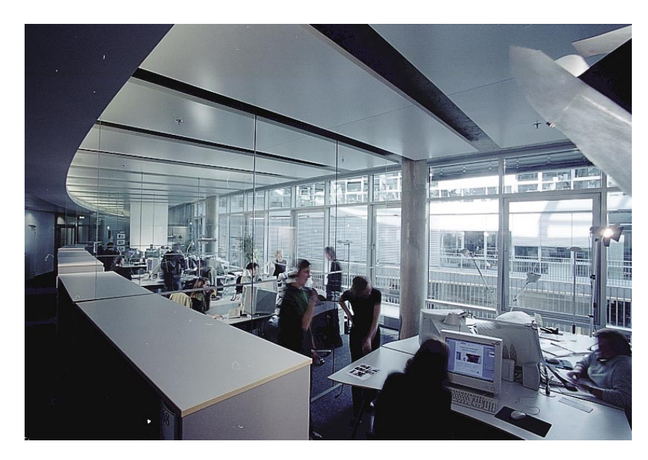
BBDO INTERACTIVE maintains a threefold quality management effort, encompassing technical research, consultation and programming, and ongoing project management.

Seeking to expand its market base beyond large companies to reach small and mid-sized customers, BBDO INTERACTIVE knew it needed to offer these services at a low price. With that in mind the company did not even consider vendors other than IBM. "Whether customers want